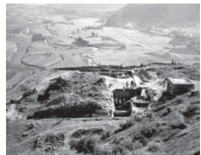
The Hindu temple atop Barikot hill, with the Swat River in the background

T his is not to say that nothing got done at the mission. Quite to the contrary, the rule seemed to be “work hard, play hard,” and everyone was expected to rise promptly at 4:30 each morning, to be ready to depart at 5 o’clock for the excavation site at Barikot. Barikot is a large hill on the left bank of the lower Swat River,