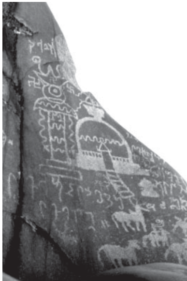
Stupas, Kharoshthi inscriptions, and petroglyphs carved on a rock at Chilas.

sometimes quite magnificent, of stupas or other Buddhist symbols and images. These carvings thus visually document, on the one