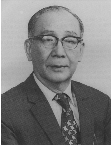
Professor Li Fang-kuei